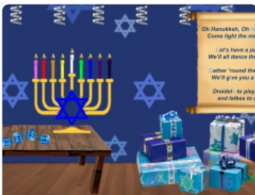
Happy Hanukkah Escape Room