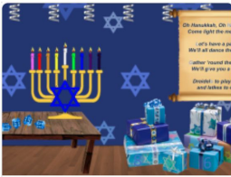
Happy Hanukkah Escape Room